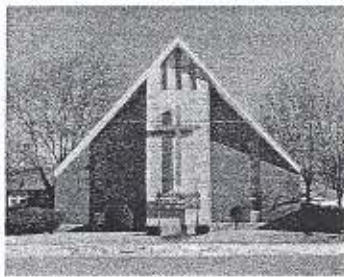
Holy Trinity Catholic Church