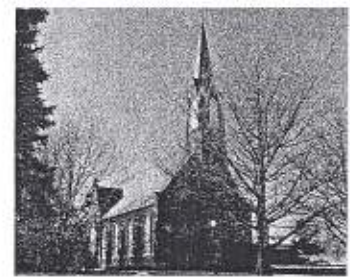
St. Patrick Catholic Church