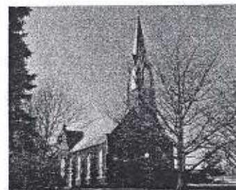
St. Patrick Catholic Church