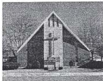
Holy Trinity Catholic Church