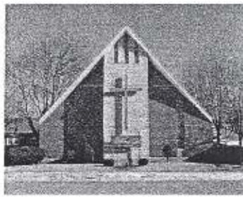
Holy Trinity Catholic Church