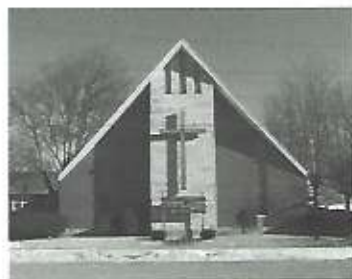
Holy Trinity Catholic Church