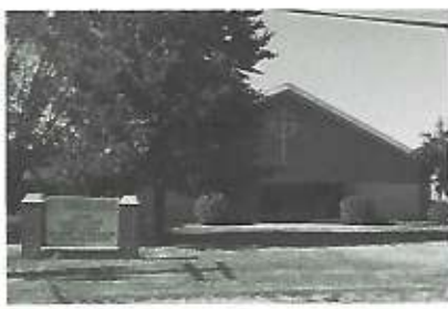
St. Thomas More Catholic Church