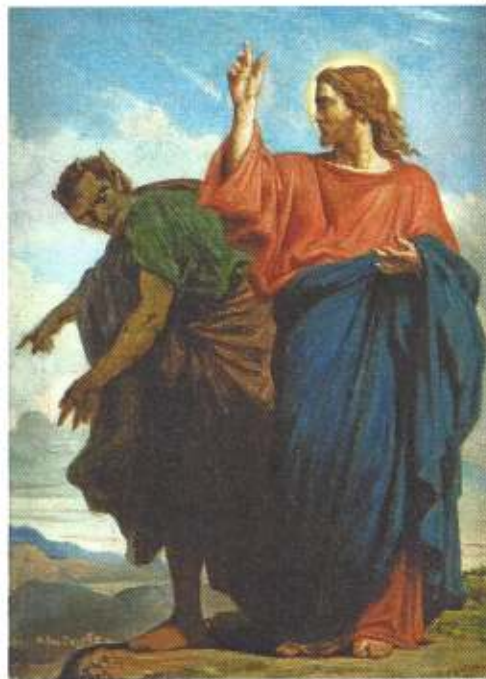
THE TEMPTATION OF CHRIST BY THE DEVIL, BY FELIX JOSEPH BARBIER, 1860

However, unlike the change in the Italian Lord's Prayer that will appear in their third edition of The Roman Missal , no immediate plans have been made to change the wording in English-speaking countries.