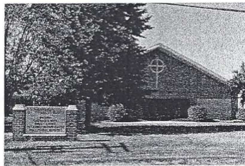
St. Thomas More Catholic Church