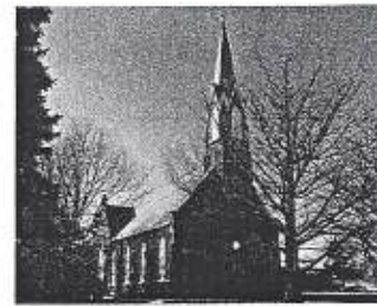
St. Patrick Catholic Church