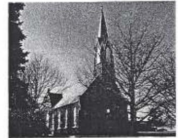
St. Patrick Catholic Church