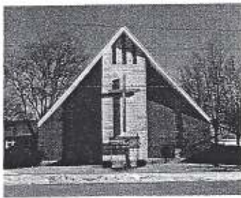
Holy Trinity Catholic Church