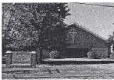
St. Thomas More