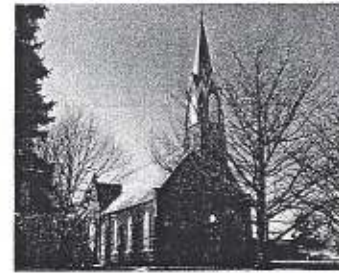
St. Patrick Catholic Church