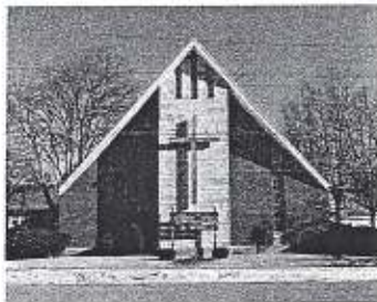
Holy Trinity Catholic Church