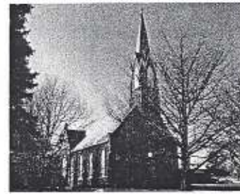
St. Patrick Catholic Church