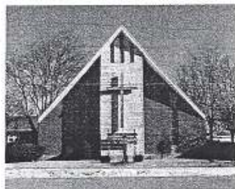
Holy Trinity Catholic Church