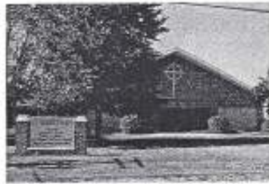
St. Thomas More Catholic Church