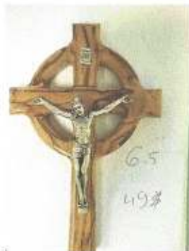
6-1/2" Cross - $49