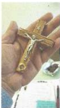
5" Cross - $15