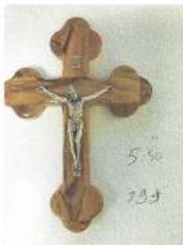
5-1/2" Cross - $19