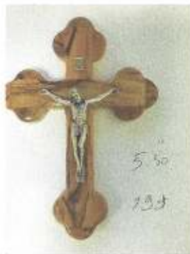
5-1/2" Cross - $19