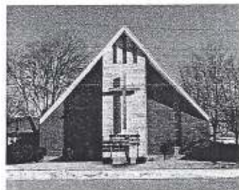
Holy Trinity Catholic Church