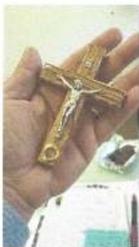
5" Cross - $15