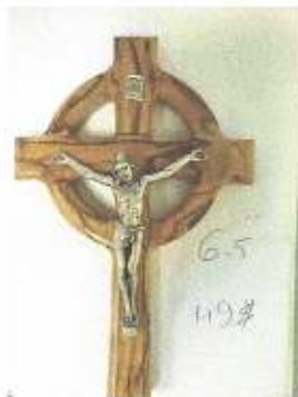
6-1/2" Cross - $49