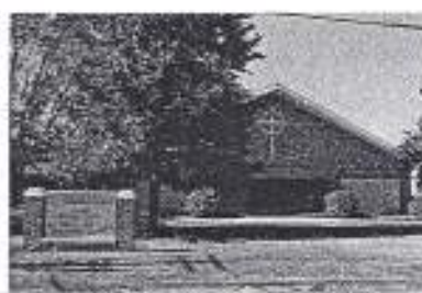
St. Thomas More