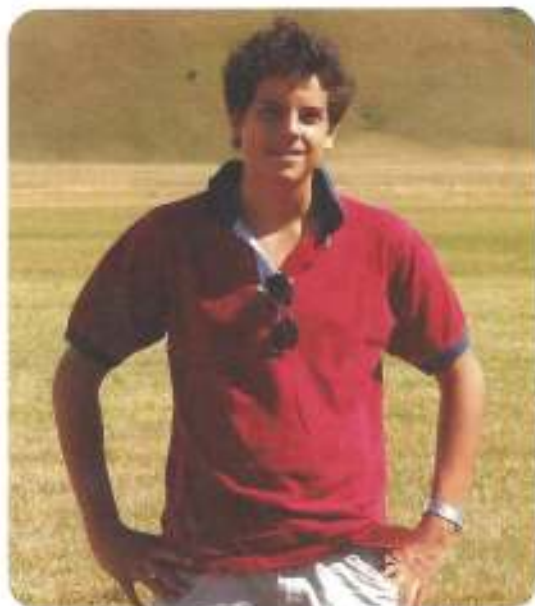
Blessed Carlo Acutis (1991–2006) served the needy and built an internet gateway for exploring eucharistic miracles.