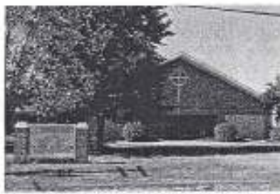
St. Thomas More Catholic Church