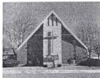
Holy Trinity Catholic Church