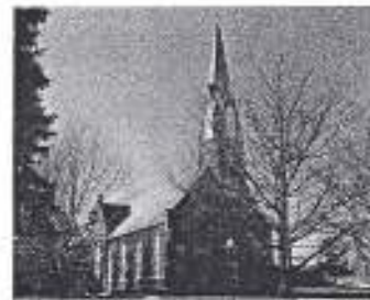
St. Patrick Catholic Church