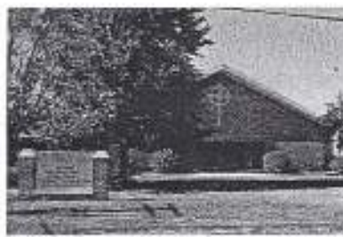
St. Thomas More