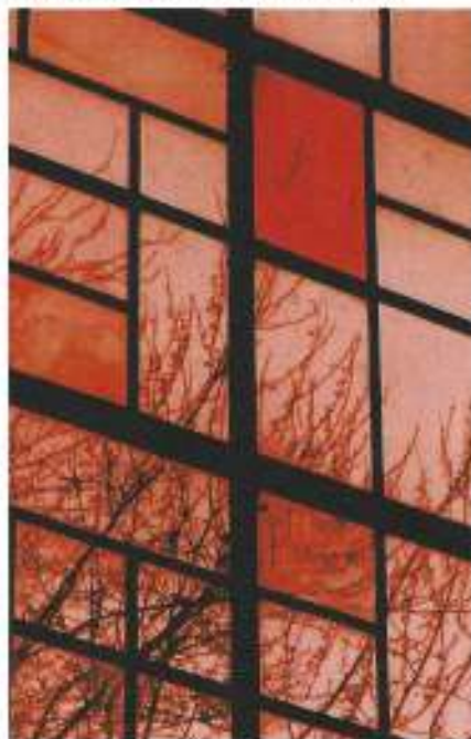
HEALING SPIRITS OSWALD / THE BEELLS

How, then, does the Church specifically pray for those who've committed suicide? Generally they're not deprived of full burial rites in the Church, which consoles the living and commends all of the dead "to God's merciful love and pleads for the forgiveness of their sins" ( Order of Christian Funerals , 6). Nor are they deprived of burial in a Catholic cemetery—a sacred place that helps bring peace to those confronted by the sudden death of a suicide.