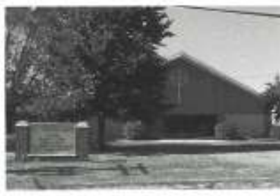
St. Thomas More Catholic Church