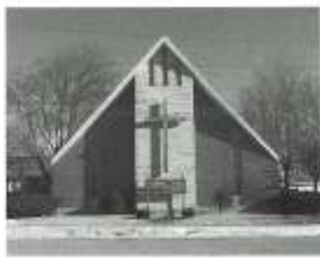
Holy Trinity Catholic Church