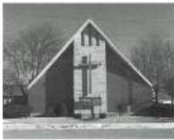
Holy Trinity Catholic Church