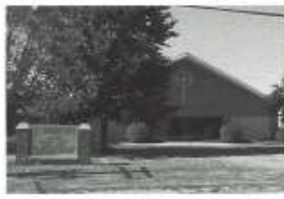
St. Thomas More Catholic Church