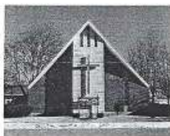
Holy Trinity Catholic Church