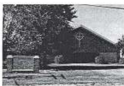
St. Thomas More Catholic Church