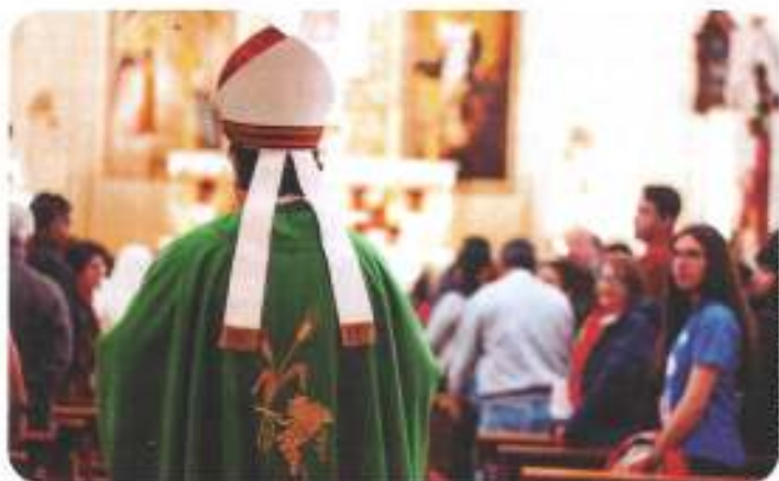
ROMEO DE WISLA / CATHOLIC

Go to DearPadre.org to send your question and to learn more about Dear Padre .