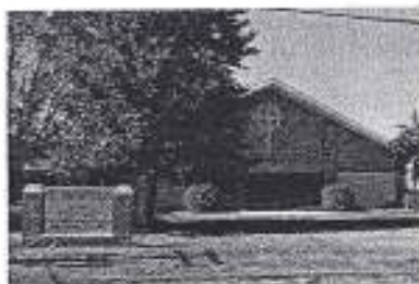
St. Thomas More