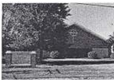
St. Thomas More