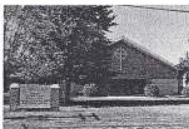
St. Thomas More