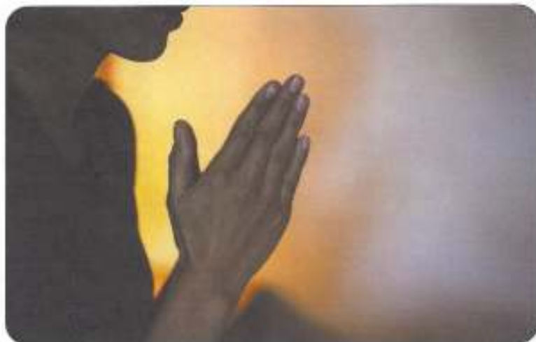
THE ARCHBISHOP OF CHICAGO