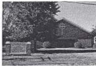
St. Thomas More

Office Hours at Holy Trinity Tuesday - Friday 9 am - 1 pm