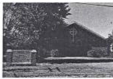
St. Thomas More

St Thomas More Catholic Church 302 Chestnut St. Dalzell, IL 61320 Phone 815-663-6201 Email thomasmore32@gmail.com